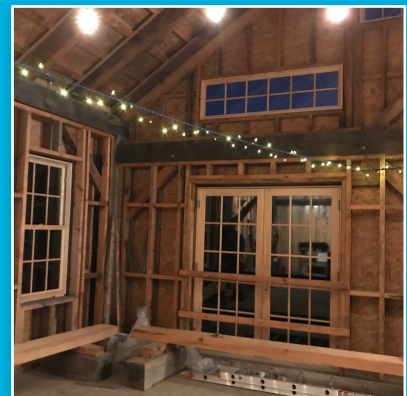
Eagle House, all lit up waiting for the school group's arrival. Even though we have a lot more to do to complete it, it still looks pretty nice!