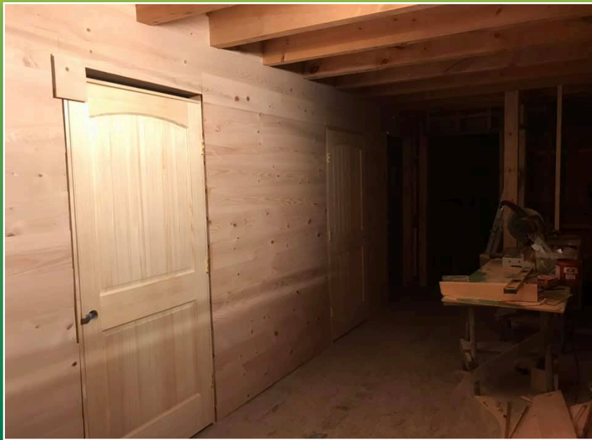
Eagle House hallway with bathroom doors. .

Where do we offer the moms' their meditation class if it's cold? And where can the families get warm after being outdoors all day? Or, what if it rains?