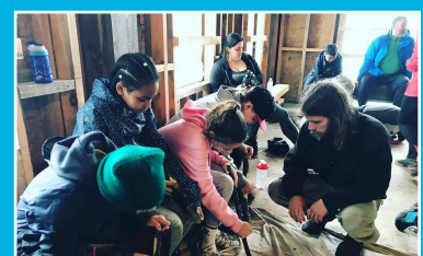
Class enjoying a craft activity on a rainy day in Eagle House.