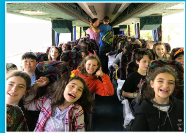
Class on the bus, heading home after their Hawk Circle adventure.

This fall is our first time running the Forest Family Retreat and we're thrilled, that with little to no advertising, this program is filled. We feel this may be a solution to reaching more children, and their parents as well, outside of the school retreats.